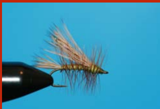
Fly of the Month: PMD Stimulator